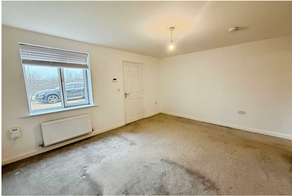
Entrance Hallway Allowing access into:

Carpeted flooring, central heating radiator and window to the front elevation. Handy under stairs storage.